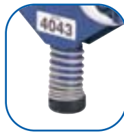
Spring Loaded Isolator