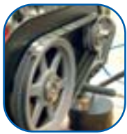
Double Belt Design